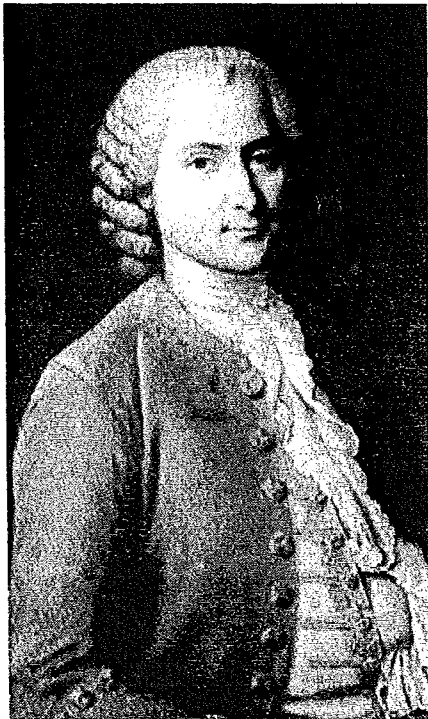
Jean Jacques Rousseau

'To find a form of association which may defend and protect with the whole force of the community the person and property of all its members and by means of which each, coalescing with all, may nevertheless obey only himself, and remain as free as before. Such is the fundamental problem of which the social contract furnishes the solution.'